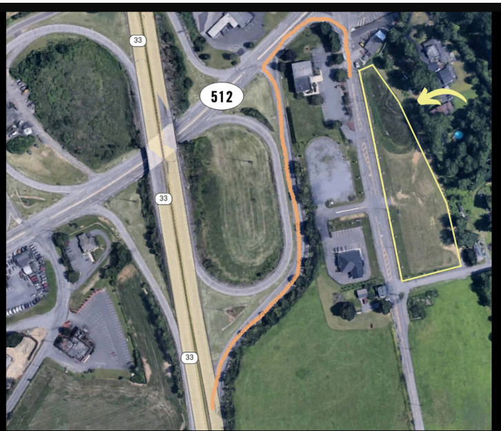
Hanna CRE 3500 Winchester Road, Suite 201 Allentown, PA 18104 <u>HANNACRE.COM</u>

All information furnished regarding property for sale, rental or financing is from sources deemed reliable. No representation is made as to the accuracy thereof, and it is submitted subject to errors, omissions, change of price, rental, or other conditions, prior sale lease, financing or withdrawal without notice. Hanna CRE will make no representation, and assume no obligation, regarding the presence or absence of toxic or hazardous waste or substances or other undesirable material on or about the property.